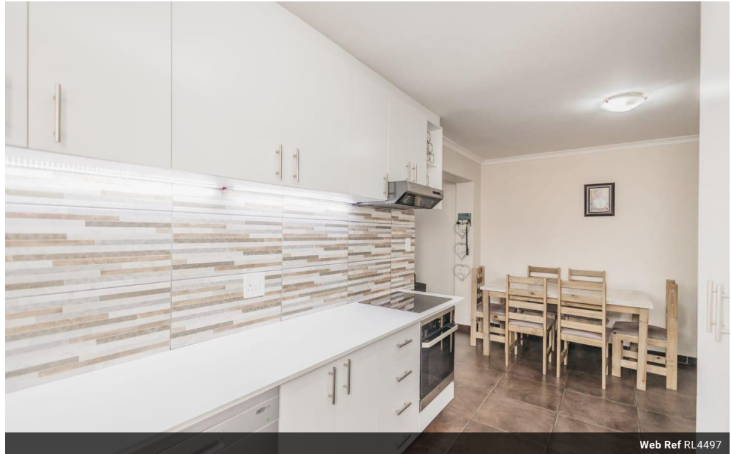
Web Ref RL4497