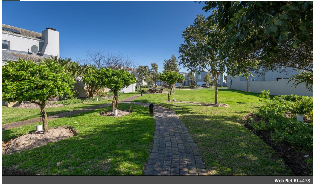
Web Ref RL4473