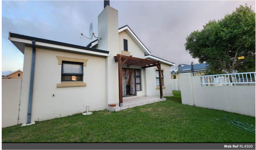
Web Ref RL4500