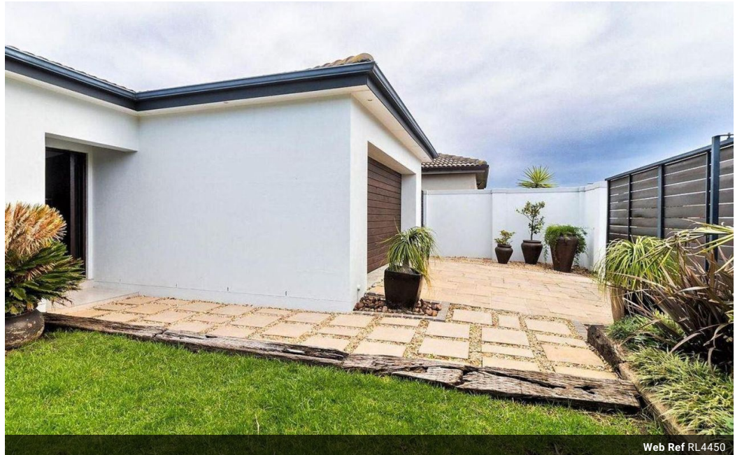
Web Ref RL4450