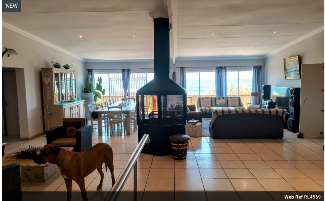
Web Ref RL4569