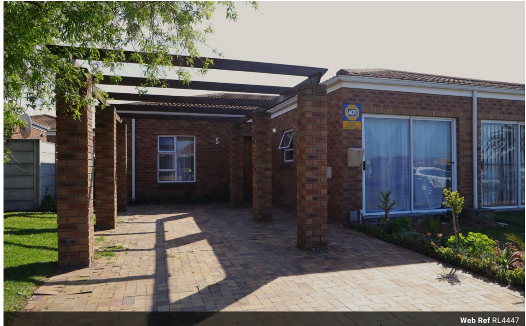
Web Ref RL4447