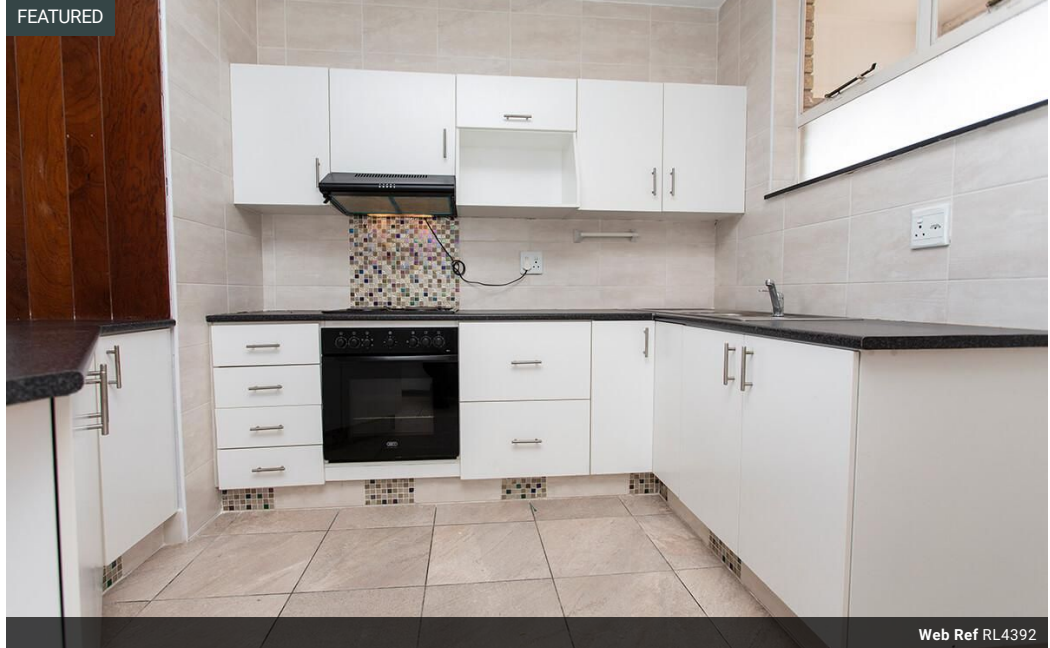
Web Ref RL4392